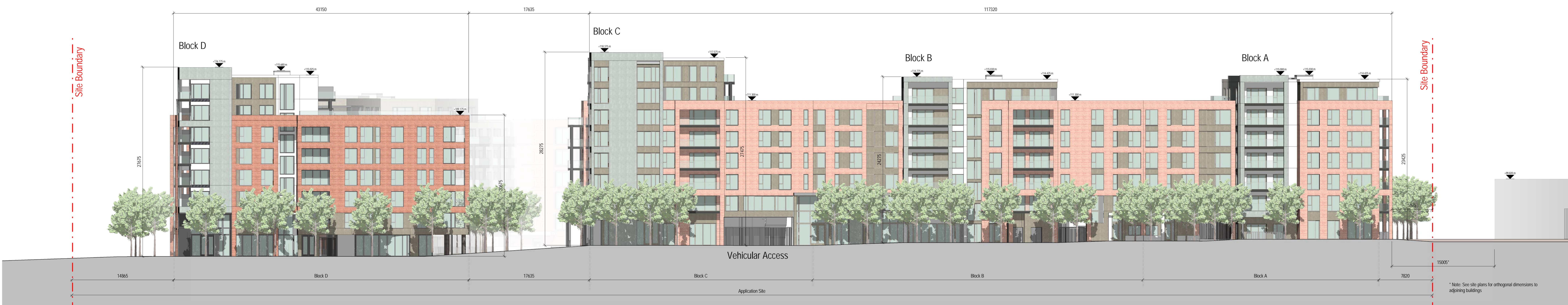
02 - Proposed Site Elevation - Ailton Road 1:200