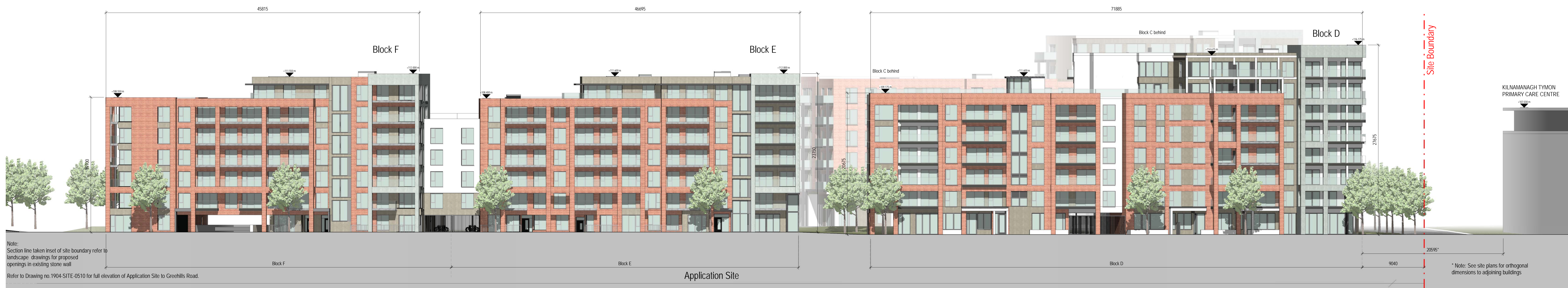
01 - Proposed Site Elevation - Greenhills Road 1:200